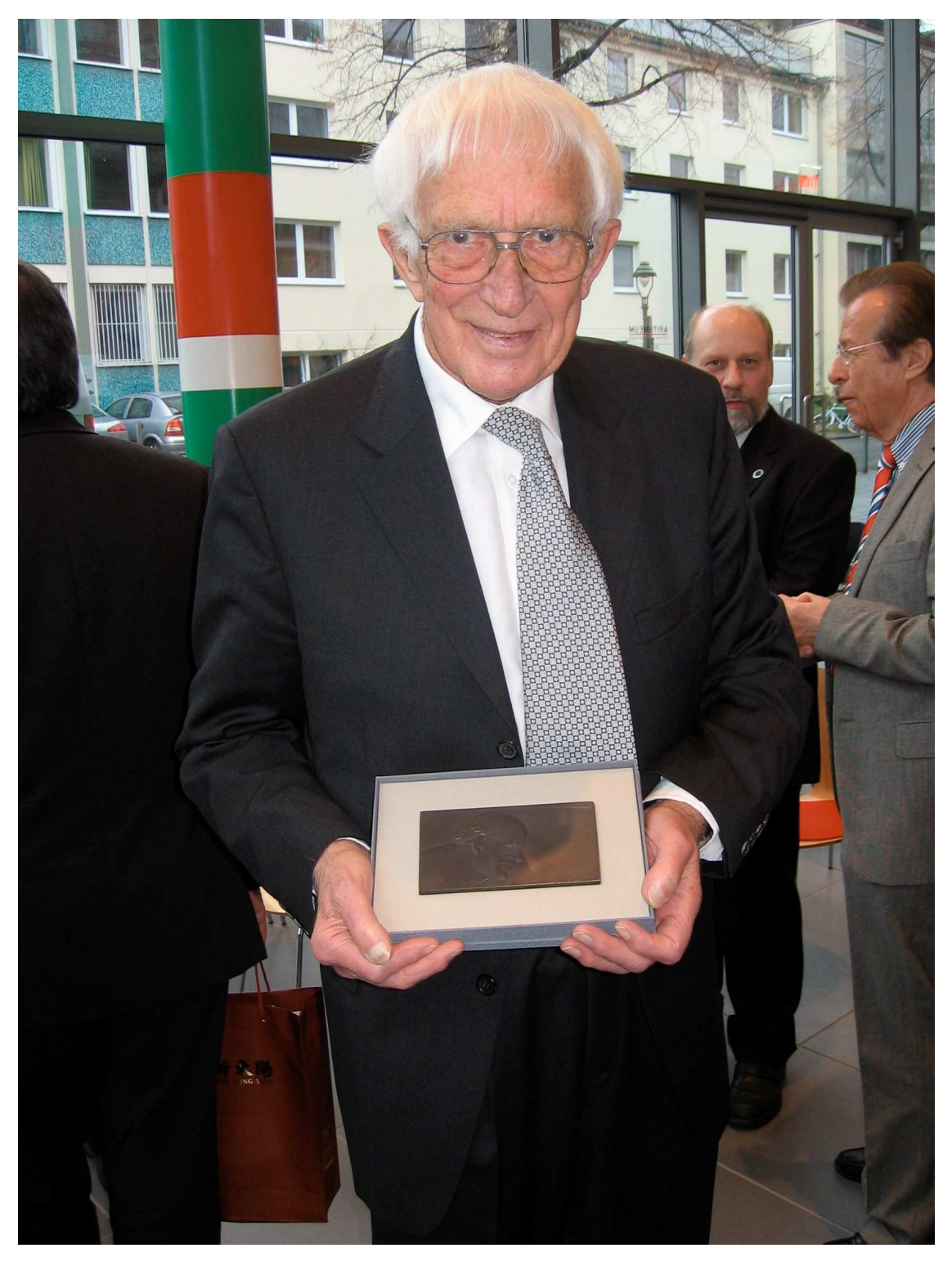
The medal ceremony and associated reception took place in Bonn on December 2^{\text{nd}} 2008. The ceremony and reception made a big impression on me. It will remain a fond and lasting memory for many years to come.