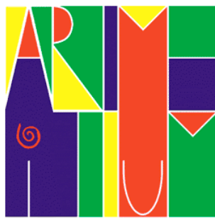
rechnen einst und heute

Let this aim become an objective for all of us – that is my wish.